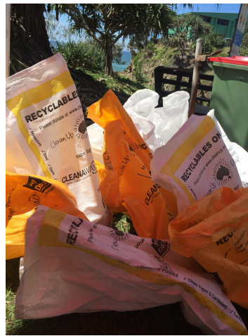
Across the island, more than 20 bags of rubbish were collected. Items such as dumped ladders and office chairs were also collected ... but didn't fit into the bags!

A huge thank you to everyone who donated their time for this event. It was a great opportunity to get the message across – thank you!