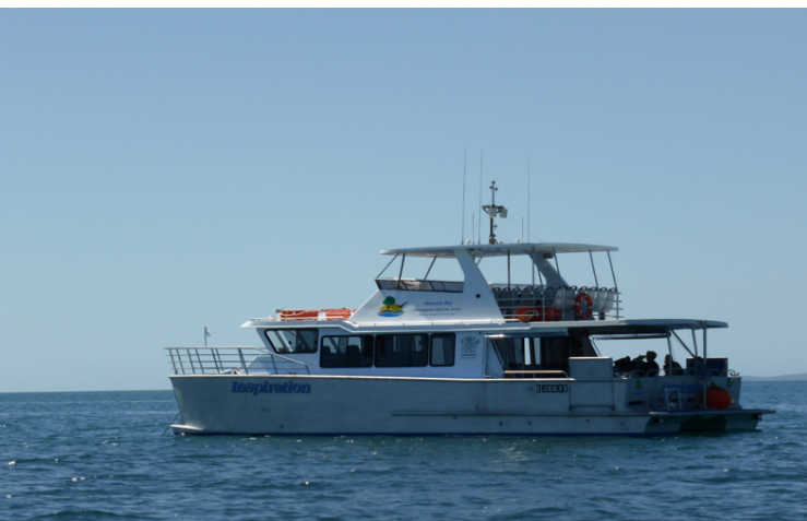
The Moreton Bay Environmental Education Centre vessel 'The Inspiration'.