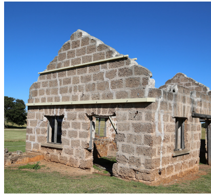
A heritage listed island, the ruins of St Helena are renowned as some of the most important parts of Queensland colonial history. As part of the cruise, we will experience a guided tour through the ruins of St Helena Island.