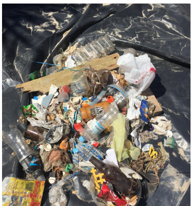
Unless we act, by 2050 there will be more plastic in our oceans than fish (by weight). Shown is an example of the type of rubbish that was collected on the day.

Membership fees are now due, and payable by June 30th. Family $18 ... Individual $12 ... or Student/Pensioner concession $6