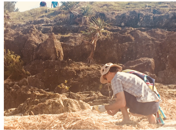
Sifting through the sand to collect small pieces of plastic is back breaking work. But cleaning up our beaches can go a long way towards protecting our oceans and marine life from dangerous microplastics - less than 5mm pieces - that are detrimental to the health of our oceans.